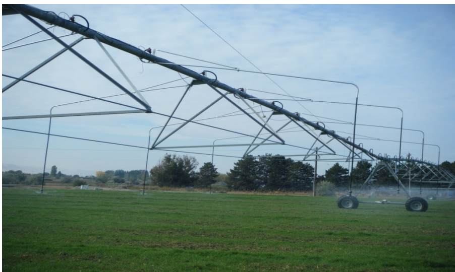
Figure 1. A part of the linear move system fitted with booms for the sprinkler runoff tests in 2013.

A linear move irrigation system, Valley 8000 Series model, 148 m long was used for this experiment. Originally the system had all of its drops directly underneath the tower frame. The system was modified to include alternating booms in two groups as shown in Figure 2. The drops for the booms were moved 15 ft (4.6 m) from the irrigation tower's frame using light-weight galvanized steel tubing (BoomBacks made by IACO, Vancouver, WA). All the drops across the linear move system (both in-line and booms) were located approximately 9 ft (3 m) apart along the tower frame and 5 ft (1.5 m) above the soil surface. The sprinkler type used on both booms and in-line drops included a Nelson S3000 spinner with a yellow plate (Nelson Irrigation Corporation, Walla Walla, Washington, USA), a sprinkler nozzle diameter of 11/64ths (4.37 mm; Nelson nozzle size # 22) and a Nelson 15 psi (103-kPa) pressure regulator to give an application rate of 3.2 gpm (12.2 L min -1 ). A pond nearby the experimental field was the source of water. The pond received surface water diverted from the Yakima River.