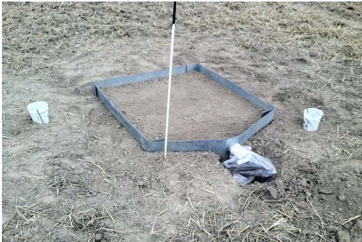
Figure 3. Runoff plot components.