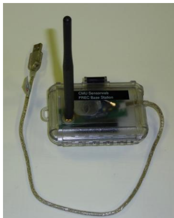
Fig 2. Basestation radio module

The basestation radio connects to the netbook over USB. The radio module consists of the antenna, the radio and a weather resistant enclosure. The communications channel in the radio can be changed to match the channel of the nodes radio in order to successfully communicate with different networks.