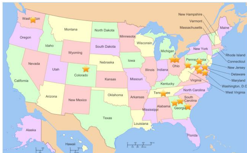
Fig 5. Map showing location of Sensorweb sites.

This system has been running at over a dozen agricultural sites (Fig. 5) over the past few years with new sites continuing to be added [Chappell & van Iersel, 2012]. The system can be setup out of the box without engineering support and runs continuously without the need of constant system rebooting. The nodes have a long battery life that minimizes direct user to node contact.