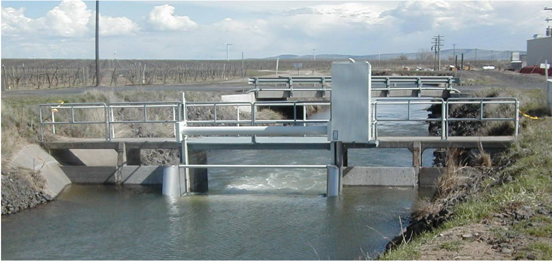
Figure 4. This check structure is controlled by a Langemann gate and control is integrated with a SCADA system. Langemann gates function as a check structure and can be used for rough flow measurements.