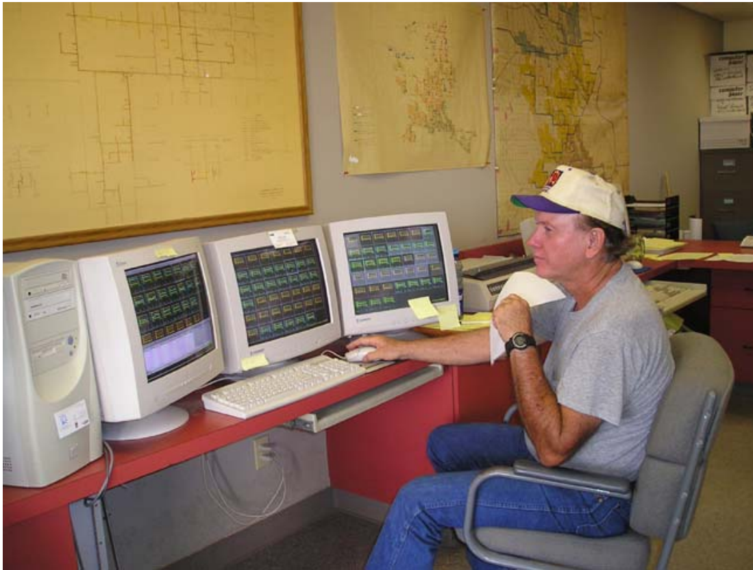
Figure 3. An operator at the Central Arizona Irrigation and Drainage District (CAIDD) near Phoenix monitors primary flows and water surface elevations in the 60-mile canal. This SCADA system was implemented at relatively low cost using affordable RTU equipment and spread spectrum radios for communication.