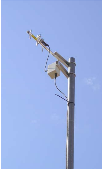
Figure 5. The SCADA system at Central Arizona Irrigation and Drainage District (CAIDD) uses spread spectrum radio which is a relatively new type of radio system that does not require federal licensing. The spread spectrum radio is housed in the white enclosure and the directional antenna shown has a line-of-sight range of approximately 5 miles. The antenna is mounted on a 2-inch galvanized steel pipe.