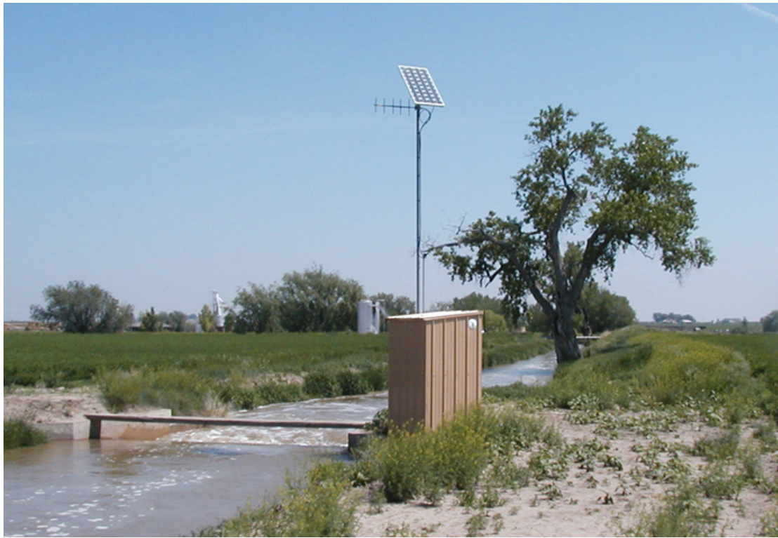
Figure 1. An example of a rated canal section which is remotely monitored using a SCADA system. RTU equipment is 12-volt DC powered from a solar panel that maintains a charge on a battery. Communication with the site is via radio.