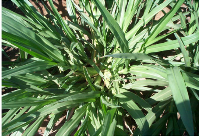
Figure 1: Elephant grasses ( Pennisetum sp ) grows in clumps or stools (Top) and have an upright growth habit as they attain heights of greater than six feet.