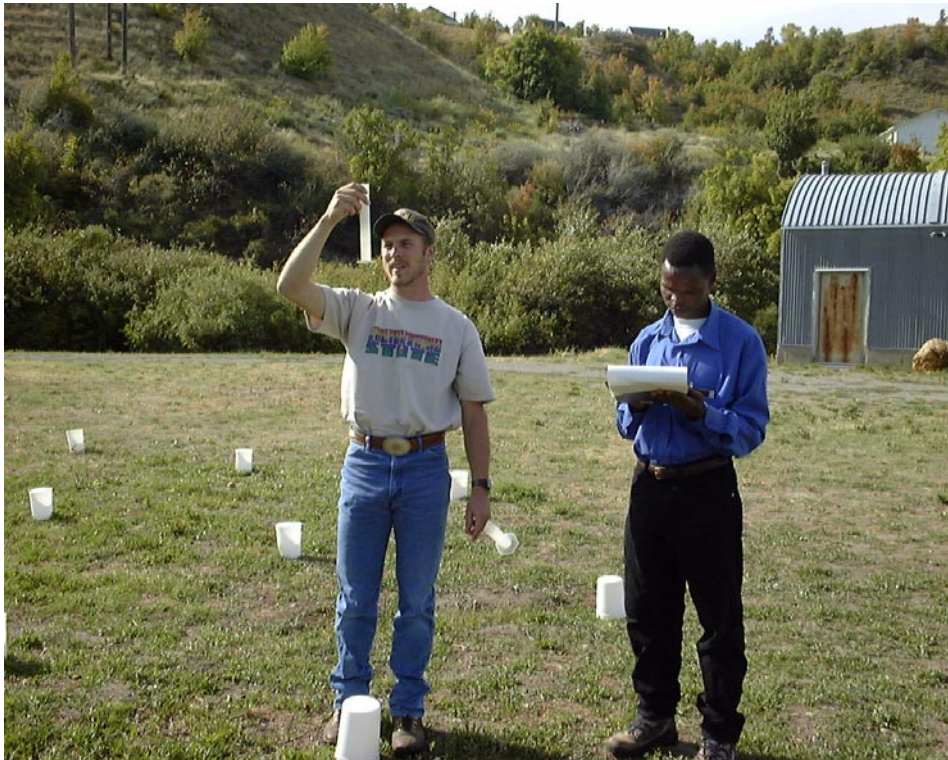
Figure 1. A catch-can test of a single sprinkler in the field.