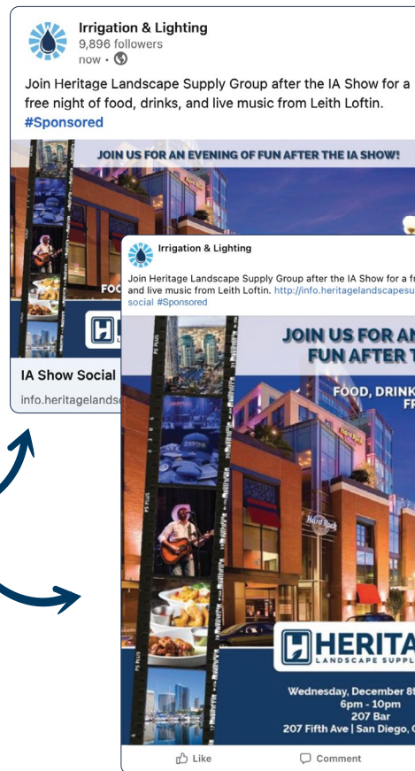
Left: LinkedIn sample Below: Facebook sample