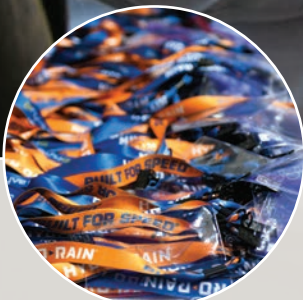
Sponsored lanyards at the 2018 Irrigation Show