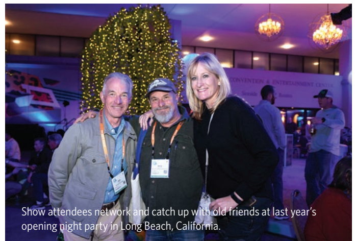
Show attendees network and catch up with old friends at last year's opening night party in Long Beach, California.