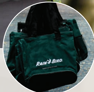
Attendees keep and reuse their trade show bags long after the show.