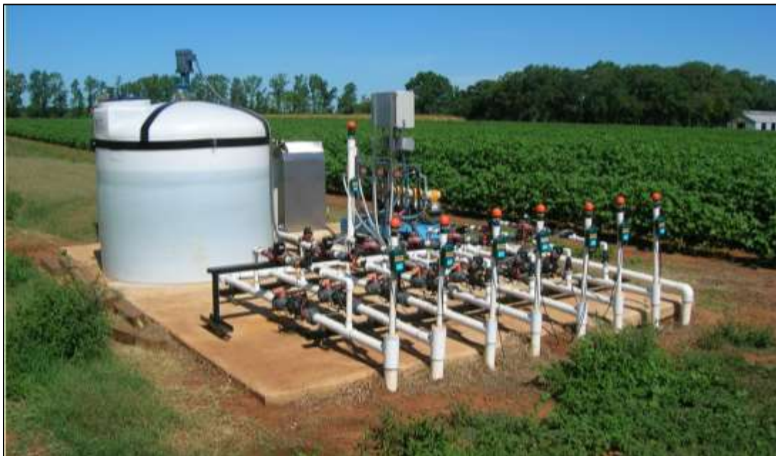
Fig. 2. Fertigation mixing tank, chemical injection pumps, and injection header for five replicated SDI fertilizer treatments and two irrigated buffer (guard) rows, Belle Mina, AL

All treatments received 135 pounds per acre of nitrogen and potassium (K 2 O), 20 pounds per acre of sulfur, and 1.0 pound per acre of boron. Phosphorus fertilizer was surface-applied to maintain P at high soil test levels. Drip fertilizer was 8-0-8-1.2S-0.06B made using 32% liquid N, potassium thiosulfate, fertilizer grade KCL, solubor, and water.