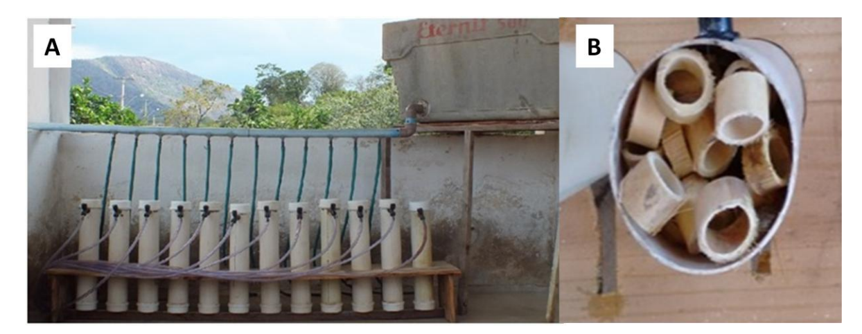
Figure 1. Effluent storage, distribution and filtration structure (A) and top view of the filter showing the filter material (B).

The equipment used for effluent treatment consisted of four upflow anaerobic filters units, constructed with 100 mm diameter PVC pipe segments, with a capacity of 5.8 L each, as can be seen in Figure 1B. As filter material we used circular segments of bamboo with average dimensions of 2 cm in height and 3 cm in diameter.