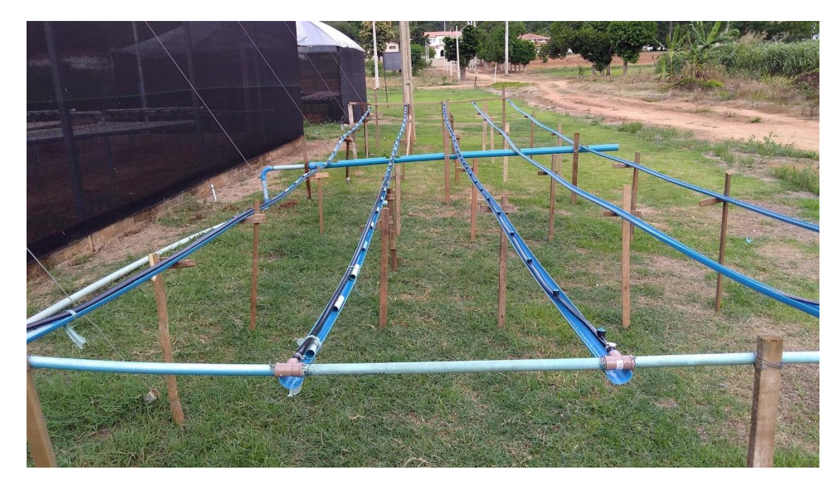
Figure 2. Tests bench for application of treatments and emitters evaluation.

The test bench was assembled using four segments of dripping tubes with 25 units per segment. Each set of two tubes was composed of a dripper model, totaling 50 evaluated drippers of each type, being: (G1) D5000 Flow Regulated self-compensating Drip Line with nominal flow of 2.1 L h-1 and (G2) Naandanjain no and rated flow rate of 1,6 L h-1. The tests bench was assembled using four segments of dripping tubes with 25 units per segment. Each set of two tubes was composed of a dripper model, totaling 50 evaluated drippers of each type, being: (G1) D5000 Flow Regulated self-compensating Drip Line with nominal flow rate of 2.1 L h<sup>-1</sup> and (G2) Naandanjain non-compensating with a nominal flow rate of 1,6 L h<sup>-1</sup>.