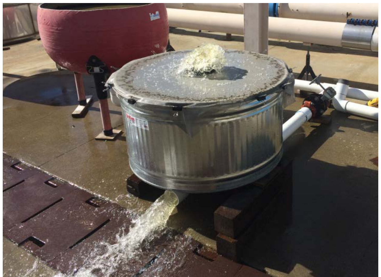
Figure 5. ITRC mushroom screen for cleaning and recirculation of filter backflush water.

water must pass. This design is common for cleaning canal water prior to entering center pivot systems in the Pacific Northwest, albeit with a much coarser screen. The screen seen in Figure 5, which was an early prototype by ITRC, used a 150 mesh stainless steel screen.