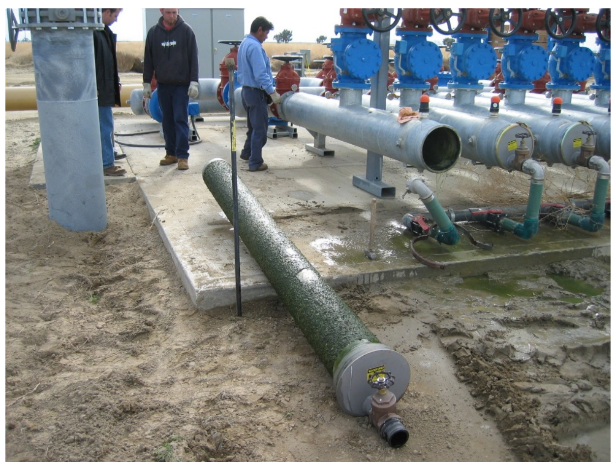
Figure 1. Typical horizontal cylindrical filter with a coarse, perforated stainless steel screen, typically used for sprinkler applications. Algae that passed through the screen can be seen on the downstream side of the screen. The complete screen has been removed from the filter housing. A 4" flush-through (not backflush) valve and hose manifold can be seen for each cylinder.