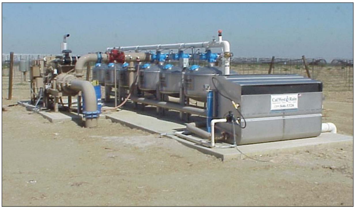
Figure 4. A media tank filtration system that uses a small commercial (FV&C) overflow screen to clean the backflush water before recycling it

For the cases in which the backflush water is returned to a reservoir or a canal, ITRC has experimented with a "mushroom" or "turbulent fountain" screen through which the backflush