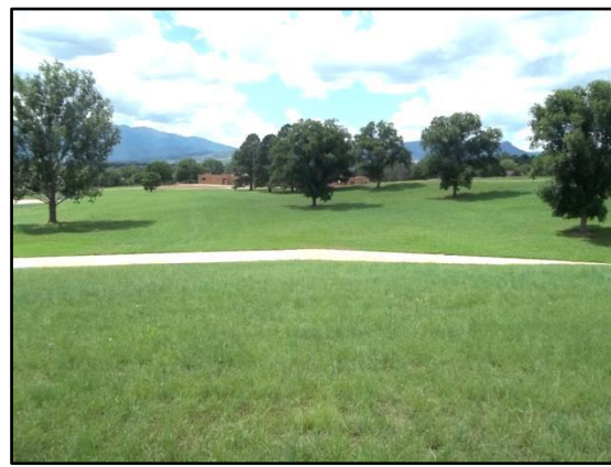
Keller Park Conversion Site