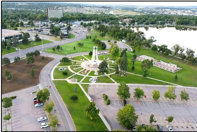
9.35 acres converted to wheatgrass at Memorial Park.