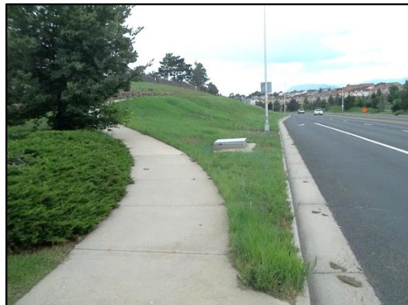
Briargate Roadway Conversion Site