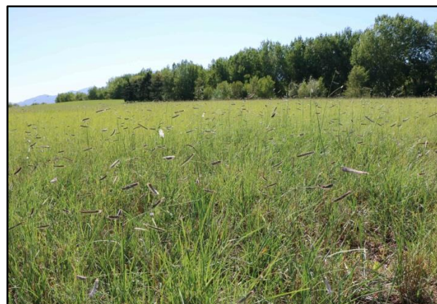
A seeded, native midgrass prairie at Keller and Wildflower Parks.