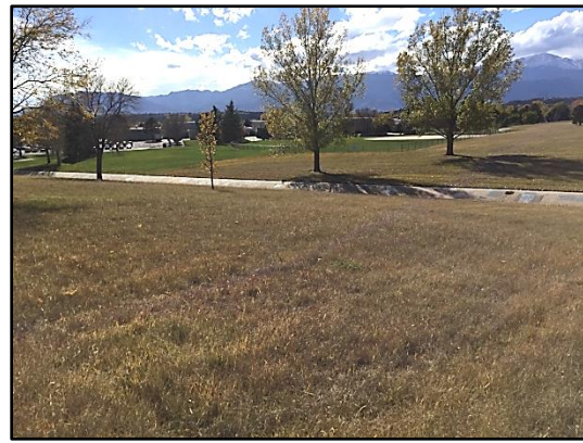
Two, 7.5 acre low-use conventional turf sites converted in 2013.