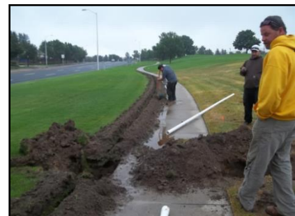
Irrigation modifications at Ford Frick Park