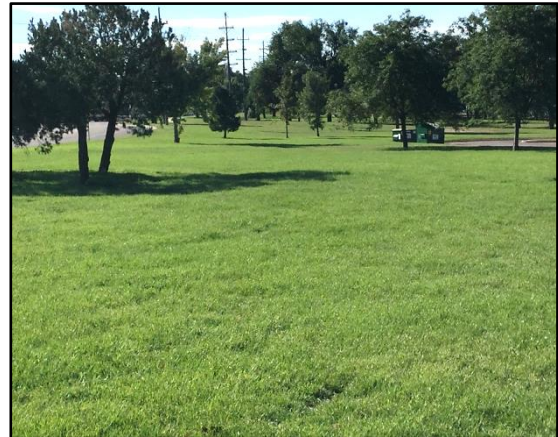
Wheatgrass area 8 weeks after seeding.