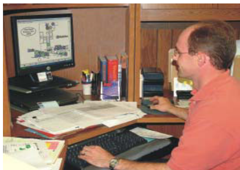
Figure 2 - Automated pivot irrigation SCADA system software by Reinke Irrigation

With many new telemetry technologies available today, it is common to have 100 percent communication to all farm pivot locations and see data throughput from pivot sites of 19.2 kbps up to 115.2 kbps. Additionally, high speed backbone telemetry is available with both serial and Ethernet connectivity with speeds close to a megabit per second range. With the use of IP wireless devices, MPEG4 IP Ethernet cameras can be added to the system for remote viewing of the pivot system and to check on the field crop or farm conditions. In addition, hybrid wireless systems can be utilized where needed to combine different wireless technologies over large geographic areas or remote locations. This can include both cellular, satellite and microwave products that can be deployed for remote areas, or if a higher speed backhaul of data is required.