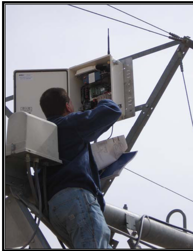
Figure 6 -- AmWest, Inc. installing the Pivot Controller with 900MHz Radio

The Modbus communication interface is built around messages. The format of these Modbus messages is independent of the type of physical interface used. The same messages used on Modbus/TCP are the same as on plain old RS232 over Ethernet. . This gives the Modbus interface definition a very long lifetime. The same protocol can be used regardless of the connection type. Because of this, Modbus allows users to easily upgrade the hardware structure of an industrial network without the need for large changes in the software. A device also can communicate with several Modbus nodes at once, even if they are connected with different interface types, without the need to use a different protocol for every connection.