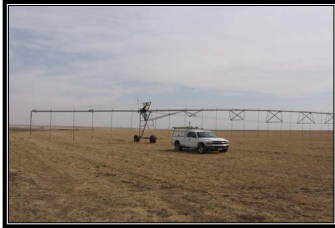
Figure 1 - AmWest, Inc. installing pivot control box.

As the automation of both private and corporate farms is embraced, we see the use of sophisticated pivot irrigation systems and smart agriculture practices due to new technologies (see Figure 1). The human imagination continues to create new ways to use this technology and push those technology providers for more powerful tools. Ten to 15 years ago, even the most advanced automated pivot systems seldom used telemetry, and, if they did, the data throughput was extremely slow and seldom provided coverage to all the pivot irrigation sites. Some of the wireless technology also was expensive. Therefore, the telemetry technology was difficult to use effectively because only some sites could be remotely monitored or where farms were paying by the data byte or monthly usage fees to the technology provider.