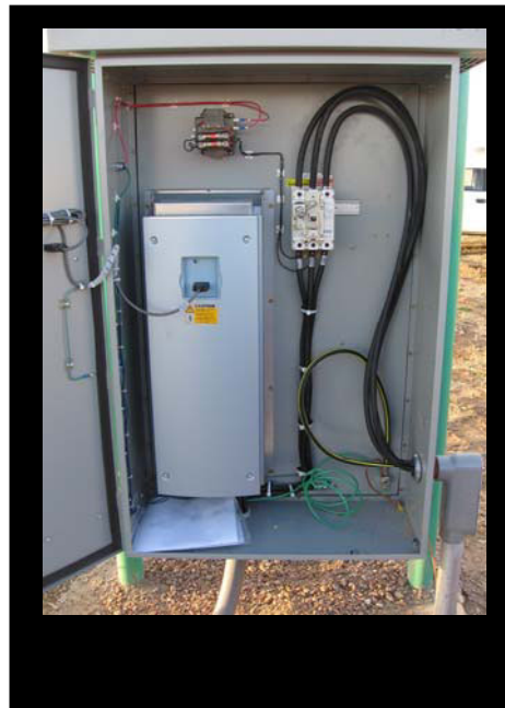
Figure 10 --New variable frequency drive for the pivot irrigation water pump that will save energy costs and help prolong the Pump life.