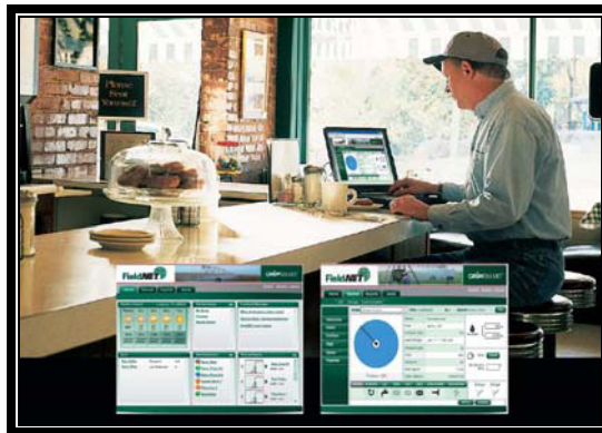
Figure 4: Lindsay Irrigation Field NET Software

The latest telemetry trend is “wireless instrumentation” or being able to control and/or monitor analog and digital signals without the constraints of wire. These signals may be used to communicate to and from the pivot to the farm to check moisture and temperature sensors, chemical soil samples, wind speed for the best time to water, the actual pivot location and pump power usage that can be viewed anytime. The capability with Web Internet access allows the entire pivot system to be viewed via a smart telephone or the user can look at a Website anywhere to have access to all the data and view the pivot irrigation system remotely. With this technology, the user of the farm can remotely operate the pivot system, report and view status changes, and see the remote sensors’ status. Until recently, all of these field devices that had to be hard-wired, or use expensive cellular or satellite communication hardware, now can be done