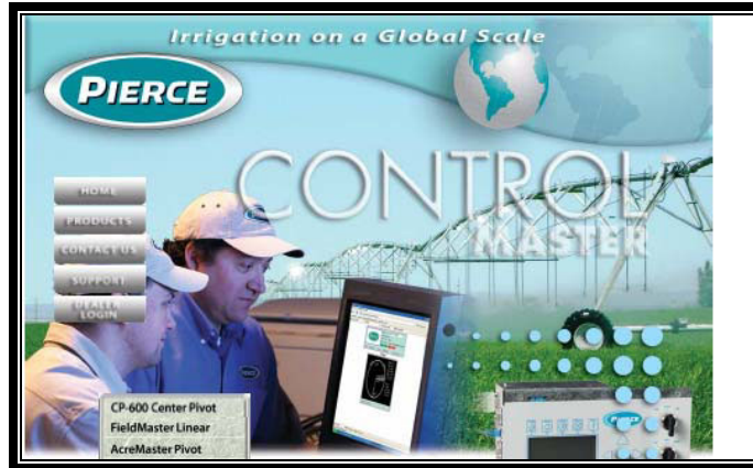
Figure 5 – Pierce Irrigation Control Master software and controller