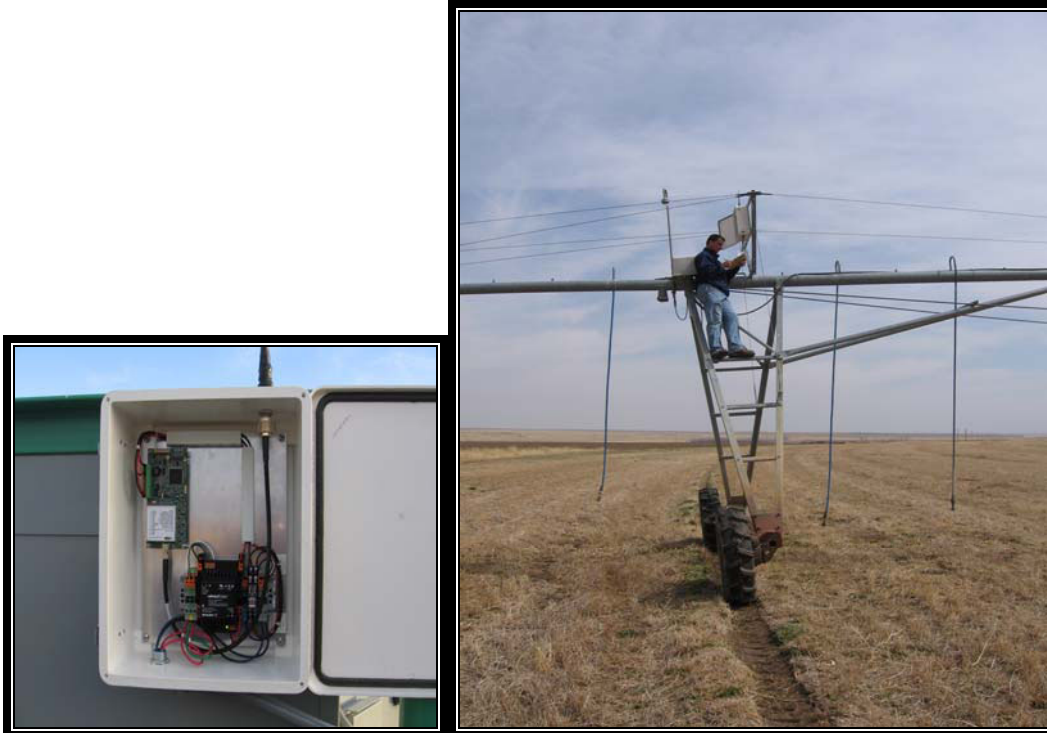
Figure 7 and Figure 8 – AmWest, Inc. installing a control box with a 900 MHz Spread Spectrum Radio