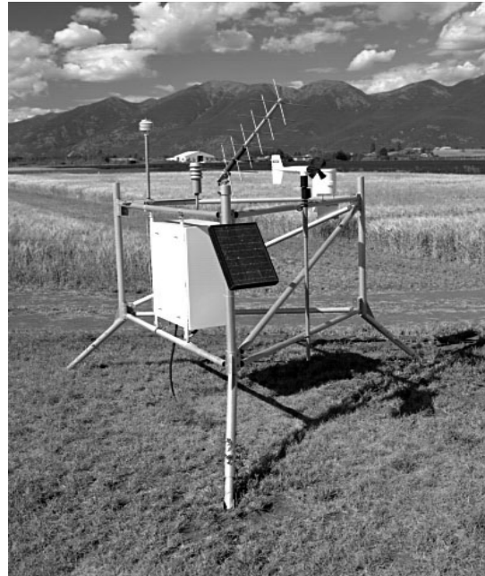
Figure 2: Typical AgriMet Station

Reliability of the data transmissions over the GOES satellite is excellent; in 2009 the AgriMet network received 99.95 percent of expected transmissions; only 200 hourly transmissions were missed out of nearly a half million expected transmissions.