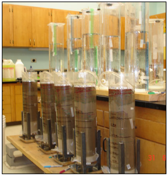
Figure 2. Irrigation of one treatment set during infiltration rate experiment.

Hence, the drops in the reservoir's water levels over time represented the infiltration rate. Water levels were recorded every 2 to 5 minutes for sand, and 3 to 10 minutes for silt until the soil column reached saturation and began to drip water. The infiltration rate decreased exponentially over time, as shown.