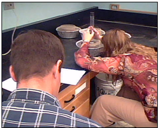
Figure 4. One researcher reads the water level on the mini-disk infiltrometer in the hydraulic conductivity experiment, while another records the readings at regular time intervals.

Cumulative infiltration data was fit to a simplified form of the Richard's Equation. Derived from the universal Darcy's Law, the Richard's Equation includes a theoretical UHC as a function of soil moisture content, denoted as K(\theta) :