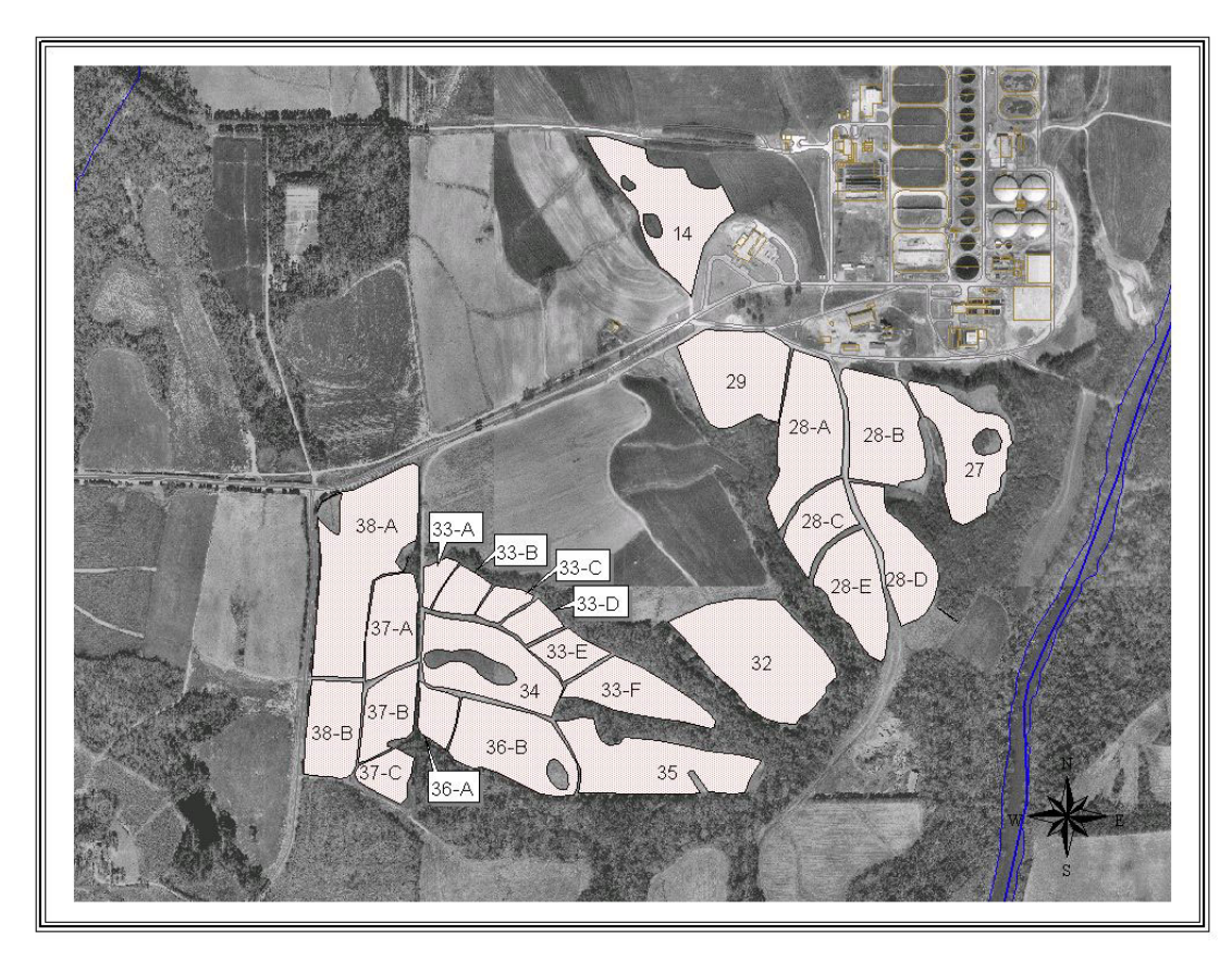
Figure 2. Irrigation Sites

irrigation nozzles during irrigation periods. Each irrigation zone will consist of an array of full-circle and part-circle sprinklers aligned to provide irrigation over the spray fields within the zone. Submains (10-inch, 8-inch, 6-inch, and 4-inch, depending on number of sprinklers serviced by the submain) will distribute effluent from the valve assembly to the individual sprinklers located within the zone. Proposed spacing between the sprinklers is based on 60 percent of the manufacturer's published wetted diameter for the nozzle size in use.