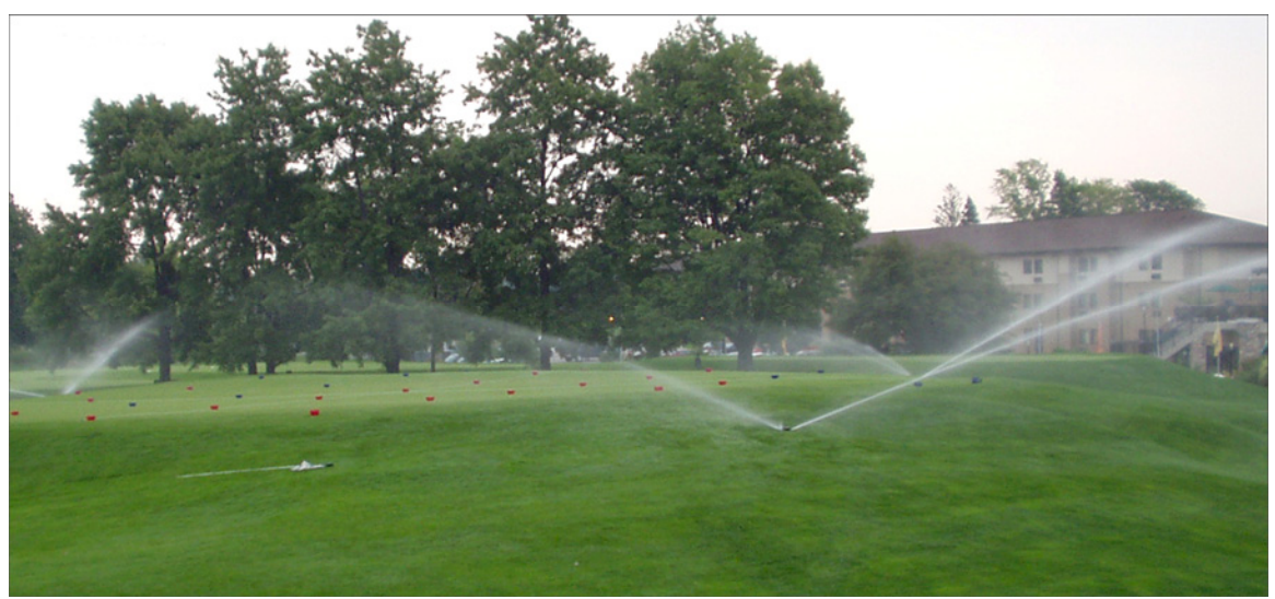
Figure 2. Sprinklers in operation during audit