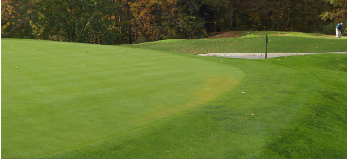
Figure 4. Portion of green 18 that received the largest amount of water during the catch-can audit. This area however does not have the highest soil moisture values and is susceptible to wilt.

northeast to the southwest corners. The volume of water applied then decreases gradually in curved bands that are centered at the sprinkler heads in the southeast and northwest corners. One feature of these figures that stands out immediately is the discrepancy in the northeast corner. This area receives more irrigation water than any other but it is also one of the driest areas - even 20 minutes after the irrigation. This part of the green has historically been susceptible to wilt and this was confirmed by visual inspection before the audit (fig. 4).