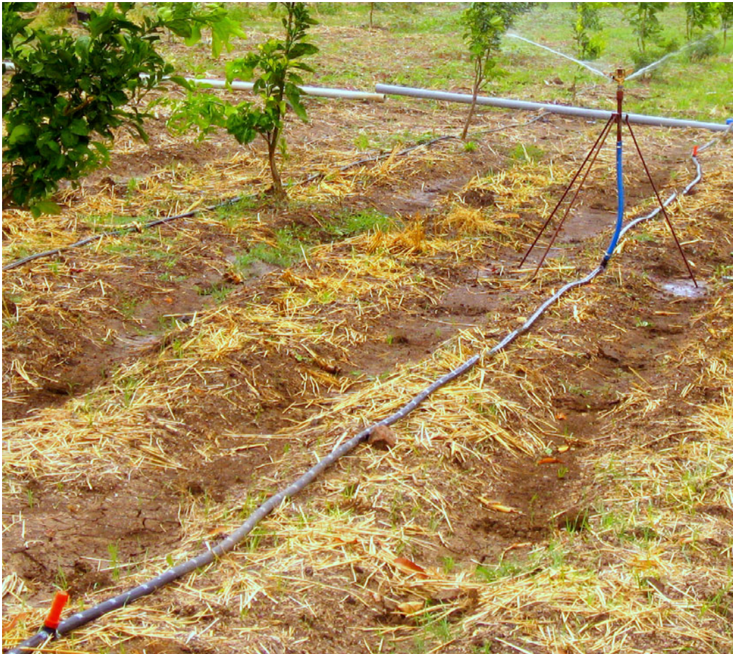
Figure 2. An 8-meter Section of 25-mm Lateral Line with an Operating Sprinkler Mounted on a Tripod and a Side Outlet Tee with an Orange Plug to Block the Flow Until the Sprinkler is Moved to that Position.

For convenience of operation, the ends of each 8-meter (or 4-meter) length of lateral have quick (cam lock) connectors. Each length of lateral also has a Tee at one end (see Figure 1). Quick connection orange (for high visibility) plugs are provided for the Tees when they are not in use (rather than having a valve at each Tee). But an on-off valve is provided for each lateral at its inlet. Figure 2 shows a sprinkler in operation at the end of an 8-meter section of lateral line. There is an orange plug in the Tee at the other end, which can be seen in the foreground.