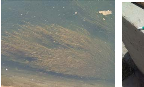
Figure 3. Sago Pond Weed

2. Sago pond weed ( Stuckenia pectinatus ) and curly leaf pond weed ( Potamogeton crispus ) at and downstream of the K2 pump station. Refer to Figures 3 and 4 .