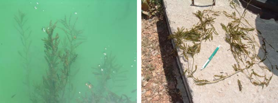
Figure 4. Curly Leaf Pond Weed

The primary purpose of algae removal is to keep pump screens clean. Screens are located at each of the three pump stations and screen water prior to it being pumped to one of the three storage reservoirs.