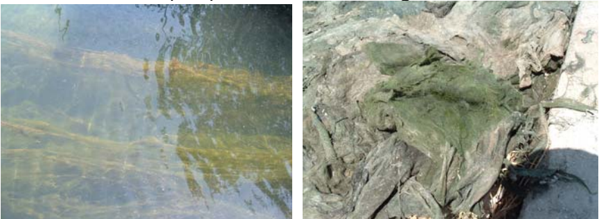
Figure 2. Filamentous Green Algae

1. Filamentous green algae ( Cladophora sp.) at all locations; most prevalent at and downstream of K1 pump station. Refer to Figure 2 .