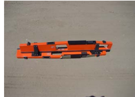
Figure 1. EM-38 meter used in this study

The study was conducted at the stillage disposal site located at the Fresno/Clovis Regional Treatment Facility, CA. Soil salinity measurements were taken in the two fields planted with Elephant grass and Sudan grass. The electromagnetic instrument used in this study was the EM-38 dual dipole (Geonics Limited, Mississauga, ON, Canada) which provides measurement depths down to 6 feet without ground contact. The instrument includes a transmitter and a receiver spaced about 3.3 feet apart in a non conductive casing. Photograph of the EM38-DD meter is presented in Figure 1. The transmitter part of the instrument induces a primary magnetic field in the ground, which creates a current in the soil matrix and generates a secondary magnetic field recorded by the receiver. The electrical conductivity (EC) being measured is the ratio of these two magnetic fields. The EM technique has been used by several researchers for agricultural and environmental applications (McKenzie et al., 1989; Slavish, 1990).