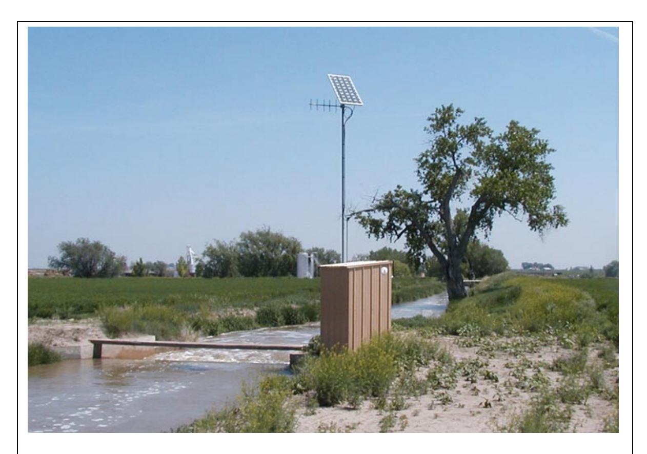
Figure 1. An example of a rated canal section which is remotely monitored using a SCADA system. RTU equipment is 12-volt DC powered from a solar panel that maintains a charge on a battery. Communication with the site is via radio.