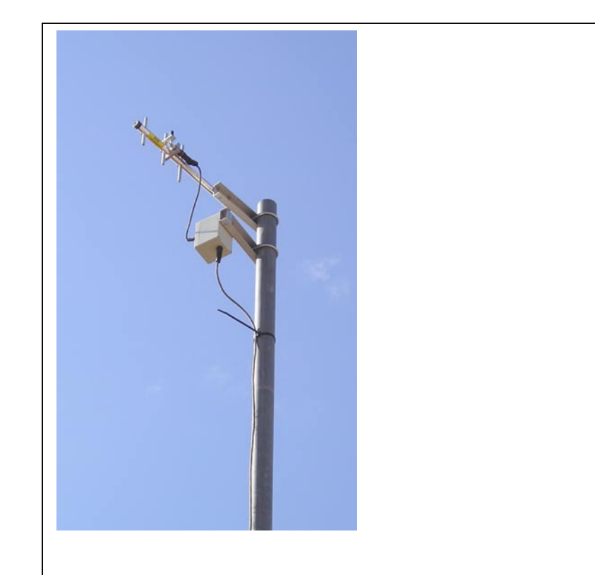
Figure 5. The SCADA system at Central Arizona Irrigation and Drainage District (CAIDD) uses spread spectrum radio which is a relatively new type of radio system that does not require federal licensing. The spread spectrum radio is housed in the white enclosure and the directional antenna shown has a line-ofsight range of approximately 5 miles. The antenna is mounted on a 2-inch galvanized steel pipe.