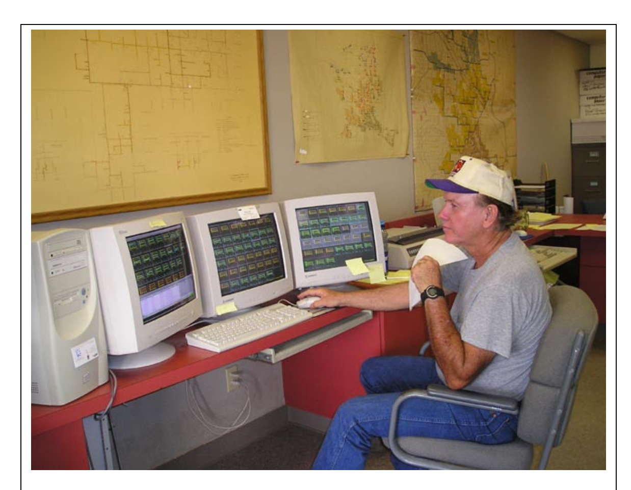
Figure 3. An operator at the Central Arizona Irrigation and Drainage District (CAIDD) near Phoenix monitors primary flows and water surface elevations in the 60-mile canal. This SCADA system was implemented at relatively low cost using affordable RTU equipment and spread spectrum radios for communication.