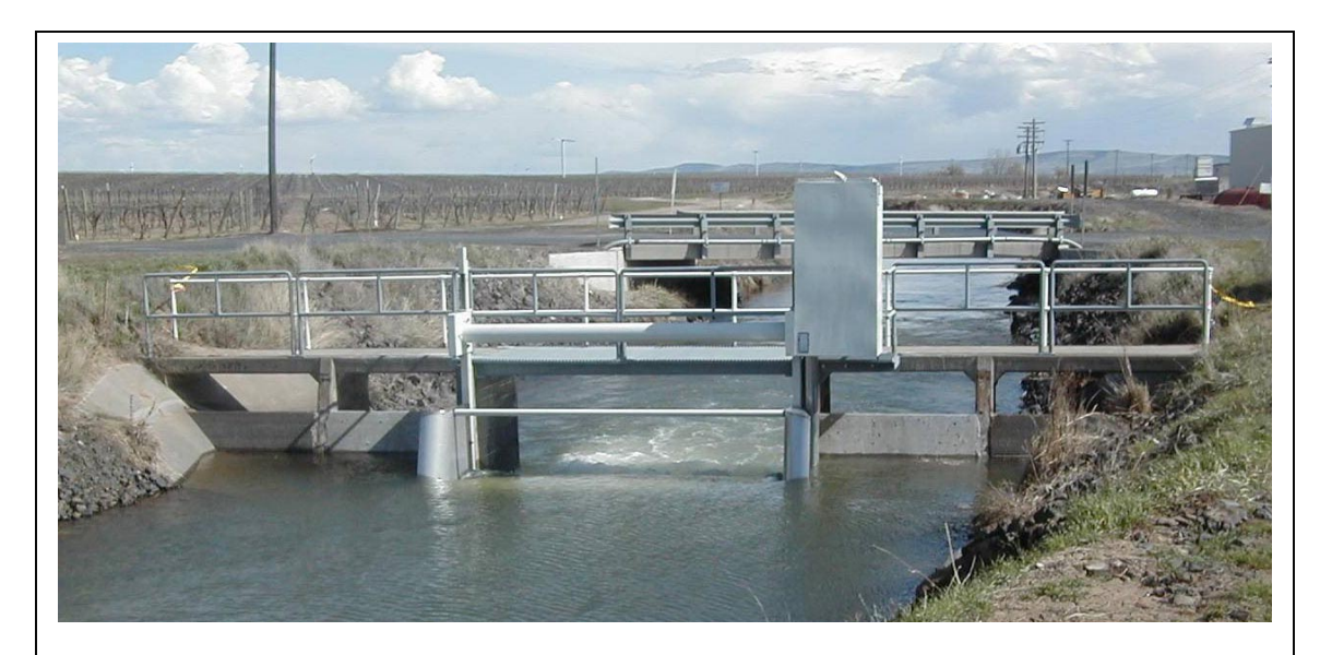
Figure 4. This check structure is controlled by a Langemann gate and control is integrated with a SCADA system. Langemann gates function as a check structure and can be used for flow measurements.